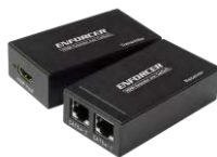
HDMI over Dual Cat5e/6