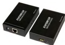
HDMI over Single Cat5e/6