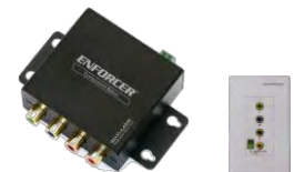
Component Video Balun over Cat5e/6

HDMI, the HDMI Logo and High-Definition Multimedia Interface are trademarks or registered trademarks of HDMI Licensing LLC in the United States and other countries.