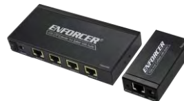
Active VGA and Audio Distributor over Cat5e/6