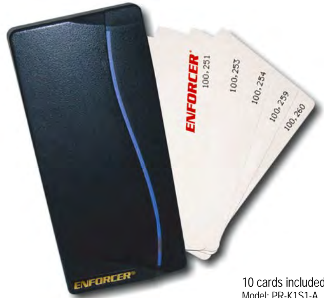
10 cards included Model: PR-K1S1-A