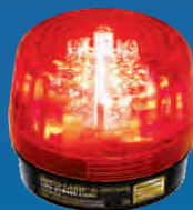
SL-1301 Series Programmable LED Strobe Light 5 Different Colors Available