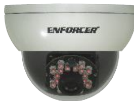
Mini Vandal Dome Cameras