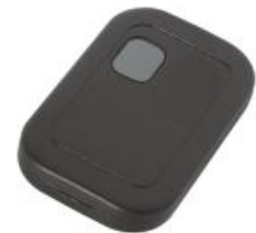
Hand-held RF Transmitters