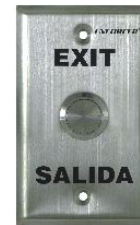
Vandal Resistant Request-to-Exit Plates