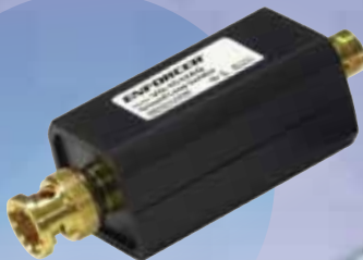
Image Problems? Connecting the VG-1C12AQ Ground Loop Isolator in-line with a camera can reduce cross talk and picture tearing and rolling by reducing interference.