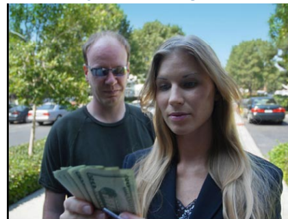
EV-2625-NKEQ Wide Dynamic Range (WDR)