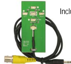
Included Remote Control