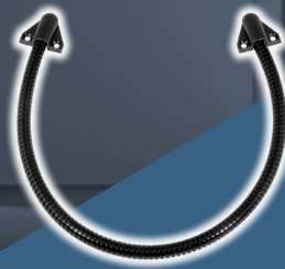
Plastic end caps, Black