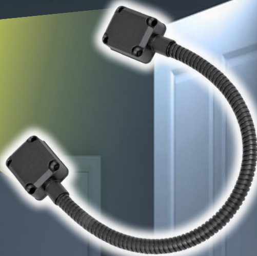
Armored Door Cord – Die-cast aluminum end caps, Black

Designed to carry wiring to conduct power to electric locks or access systems mounted in doors, protecting from vandalism and normal wear and tear