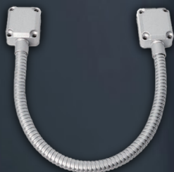
Die-cast aluminum end caps, Silver