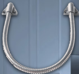
Plastic end caps, Silver