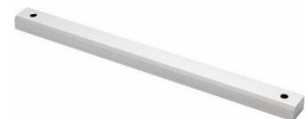
E-941S-1K2/F43Q ( \frac{1}{2} ", shown) E-941S-1K2/F53Q ( \frac{5}{8} ")