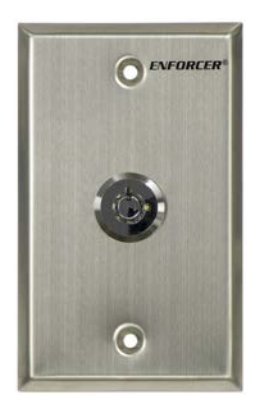
Single-gang SD-72051-V0 SD-72002-V0

*Note that for large-volume orders it is possible to order a different key number (1301-1310). Please contact SECO-LARM for details.